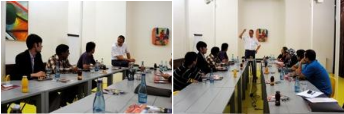
Joanneum Graz, presentation by museum staff

During a three-day trip to Graz, the curators visited and worked in the Universalmuseum Joanneum. Training started with a presentation on the history and organisation of the museum.