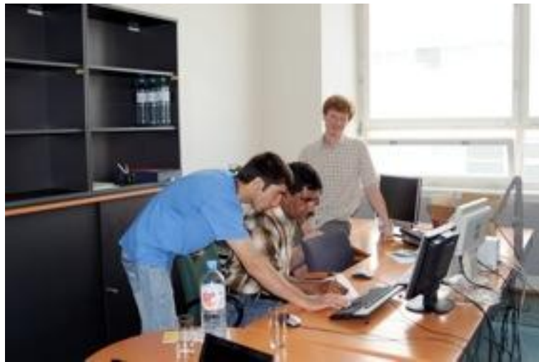
Department of Art History, University of Vienna, IT-training