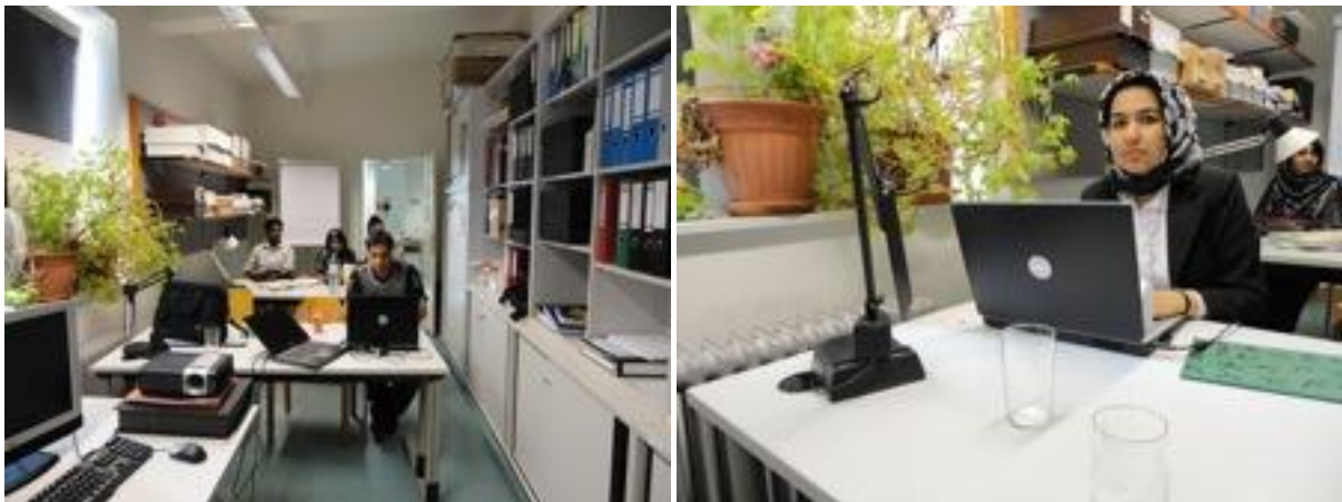
Seminar training classroom at the Department of Art History, University of Vienna