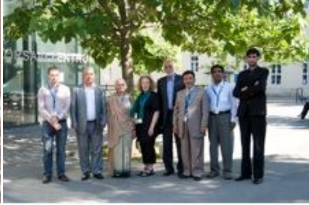
EASAA Conference, University Campus, Lecture hall C1

At the Conference, the curators heard lectures and presentations on a broad range of topics, and they were able to talk to and make contacts with international specialists.