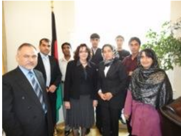
Afghan embassy, Vienna