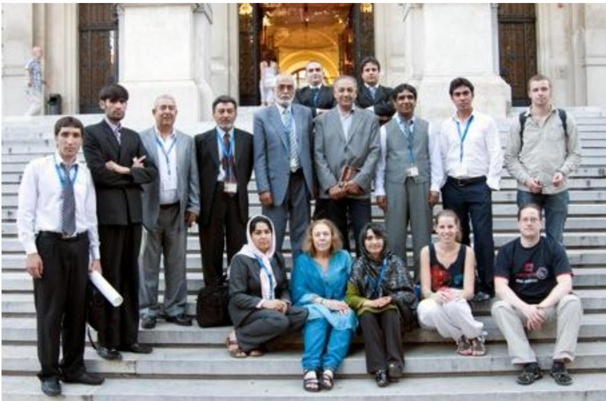
At the close of the EASAA Conference

At the Conference, the curators heard lectures and presentations on a broad range of topics, and they were able to talk to and make contacts with international specialists.