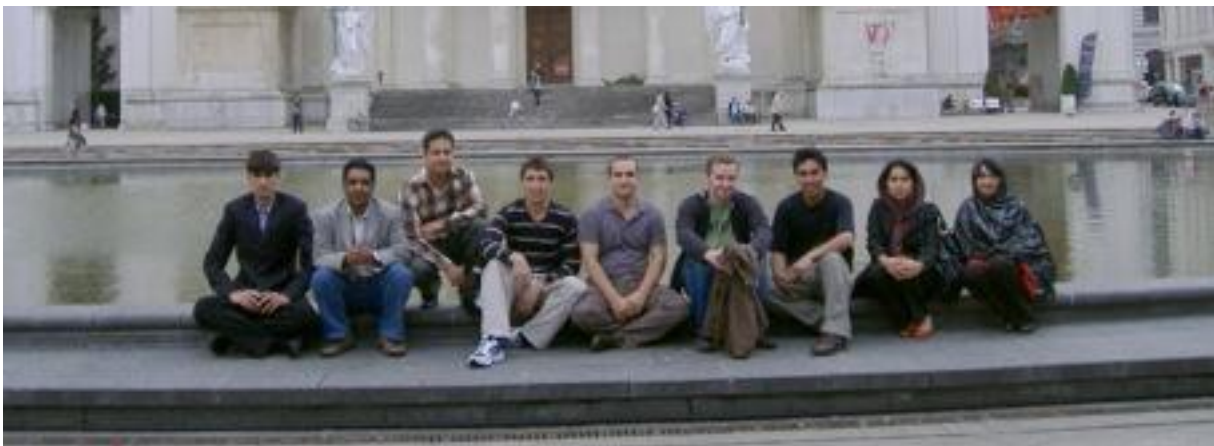
City tour, in front of the Karlskirche in Vienna

The curators were housed in two apartments near the Department of Art History. They were provided with three prepaid mobile phones and a daily per diem of € 25 for their meals and everyday needs.