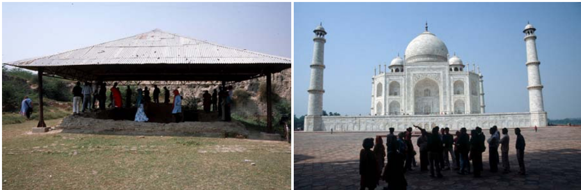
Group visits to excavation site of Sonkh (left) and Taj Mahal (right).

Group visits to the monuments of Mehrauli Archaeological Park (04.10.); Lotus Temple, Dilli Hat Market, Safdarjung Tomb, Hauz Khaz Village (05.10.); Ramayana performance (09.10.); numismatic collections at National Museum of New Delhi (10.10.); Red Fort, Old Delhi Market, Jami Masjid mosque (11.10.); Nizamuddin Tomb and complex (16.10.); excavation site of Sonkh and Mat, Mathura Museum (17.10.); to Agra: Taj Mahal, Itimad-ud-Daulahs Tomb, Sikandra (18.10.); Gandhara and Central Asia collections in National Museum of New Delhi (22.10.); Humayuns Tomb, Nehru Memorial Museum and Library (25.10.); Old Delhi Market, Jami Masjid mosque, India Gate (28.10.); Tibet House Museum and Library (29.10.); Akshardham Temple (Akvita Singh) (31.10.).