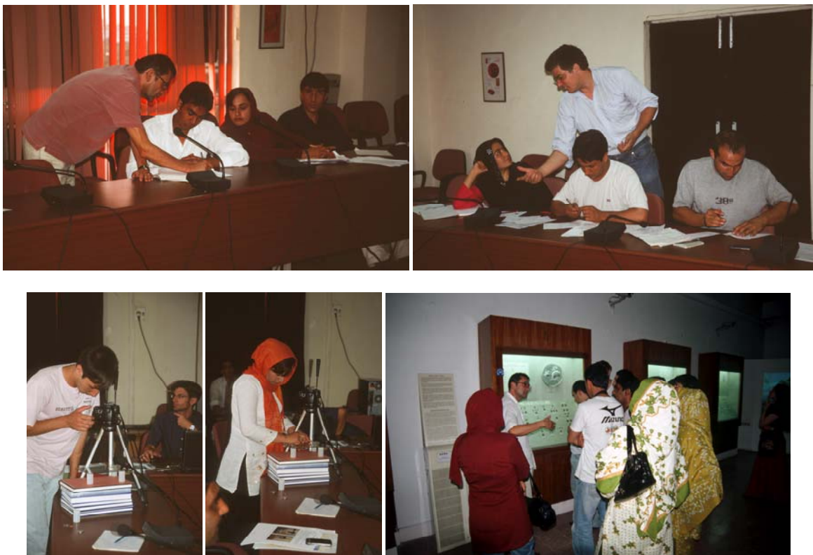
Numismatics Training at JNU and National Museum New Delhi.

Despite occasional difficulties with the English language all curators of the Kabul Museum are to be complimented for their diligence. The curators worked intensely 6 days a week and learned a great deal. It seems very desirable to proceed with teaching this fundamental course. More specialized training will be given especially for the curators responsible for coins of the Greco-Bactrian and Kushan-periods. We continue to sponsor intensive English courses in the Kabul Museum.