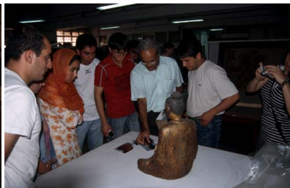
Art History Training at National Museum New Delhi and Mathura Museum.